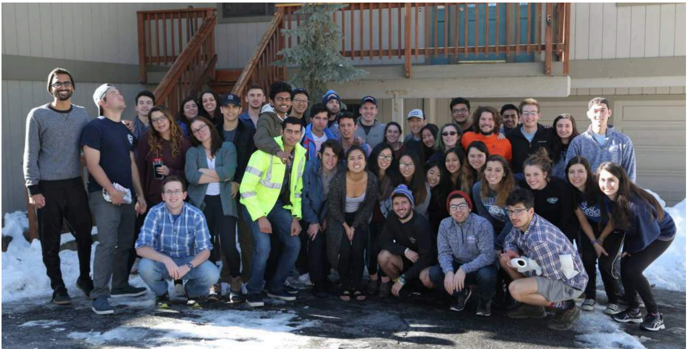
SKI TRIP 2017 42 members attended the annual Ski Trip at Big Bear Lake.

Overall, this quarter had a handful of “social” events which were not as traditional as events planned by social chairs in the past. However, in spring quarter there will likely be more traditional social events due to PSWC being over. So, buckle up and get ready for another quarter of fun.