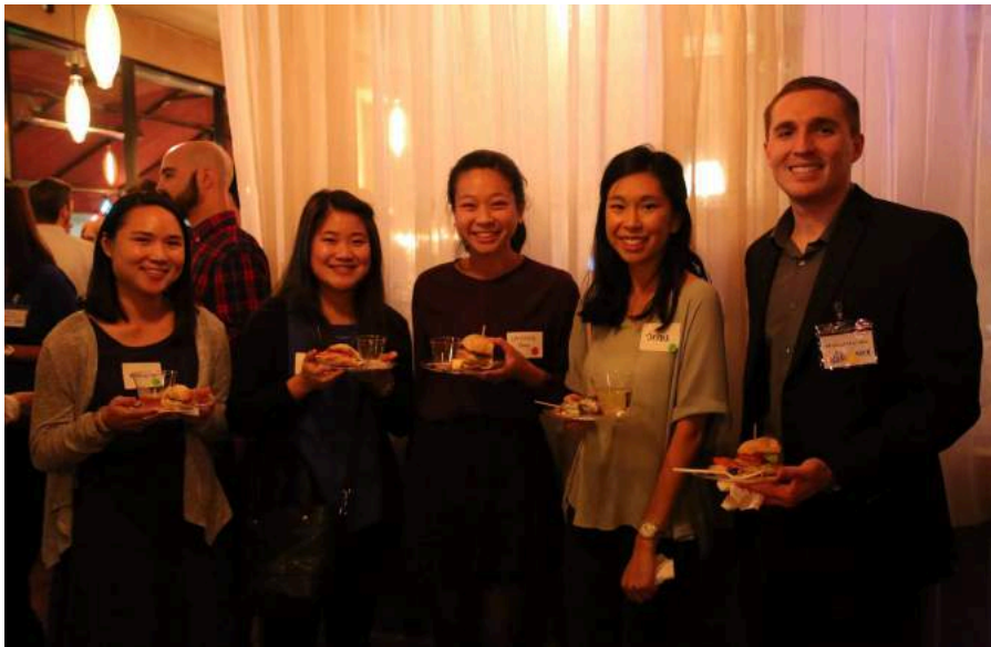
NETWORKING NIGHT Company representatives and students enjoy some delicious food.