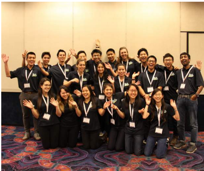
ASC67 COMPETITION Mixed Use team presents its proposal ( bottom ) and all visiting students pose for a group picture ( left ).

This year was our fourth time participating in the competition, and like the years before, we really enjoyed it. Throughout the competition week, we learned a lot about the competition and the construction industry, after speaking to many company representatives and judges of the competition. Also, we were frequently occupied with many fun activities like the all-you-can-eat banquet, networking events, and career fair. Because of this, many of our first-year members are looking forward to return next year, contributing to the growing student interest in construction management at UCLA. With the fun learning experience and all the help we have from our coaches, professors, and sponsors, we are excited for the fifth run!