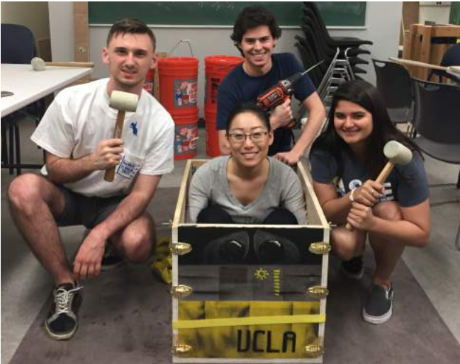
GEOWALL TEAM Team members pose with the completed sandbox before the National Competition in Orlando, Florida.

The GeoWall project is looking forward to competing at the Pacific Southwest regional competition this year, and is anticipating excellent placement after competing at the national competition held this year in Orlando, Florida. While UCLA placed 13 th out of 20 competing schools, our team learned some valuable lessons and has already taken steps to improve our design performance.