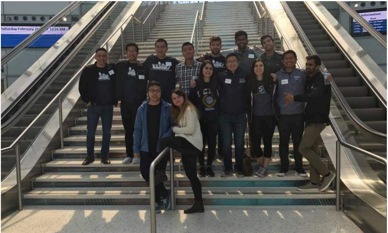
ANNUAL POPSICLE STICK BRIDGE COMPETITION ASCE at UCLA volunteers at the event organized by LAYMF.