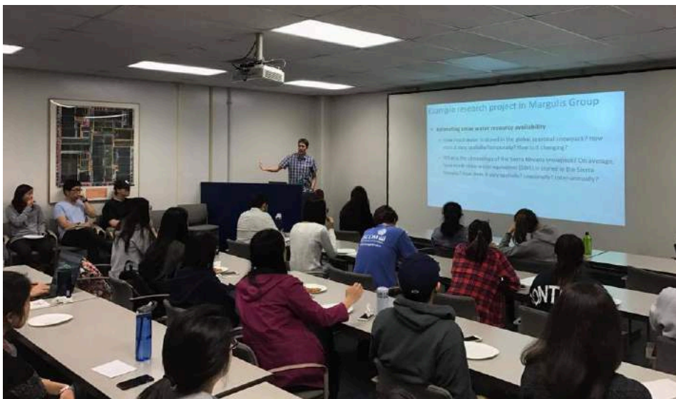
FACULTY RESEARCH WORKSHOP Faculty members talk to students about various research opportunities.

Outreach enjoyed another successful quarter as we organized several faculty workshops and alumni socials this winter. At the beginning of the quarter, professors from the CEE department gave an informative lunchtime presentation about their specific fields of study within civil engineering to better aid students as they begin selecting upper division electives and deciding which tracks to pursue. Several weeks later, some professors returned to speak about their research projects and opportunities for undergraduate students to get involved in labs. The presentations were very helpful and well-received by everyone in attendance, and we appreciate our professors taking time out of their busy schedules to speak with us! In addition to the faculty events, ASCE alumni were invited to attend a BBQ and gymnastics meet viewing on campus in February. The event was a great opportunity for alumni to reconnect with old classmates and meet current students, and we're looking forward to even more fun and informative events in the spring!