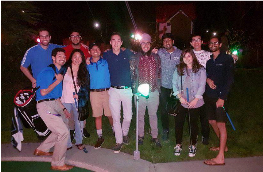
MENTORSHIP MINI GOLF All families were in good attendance at this fun mini-golf social.