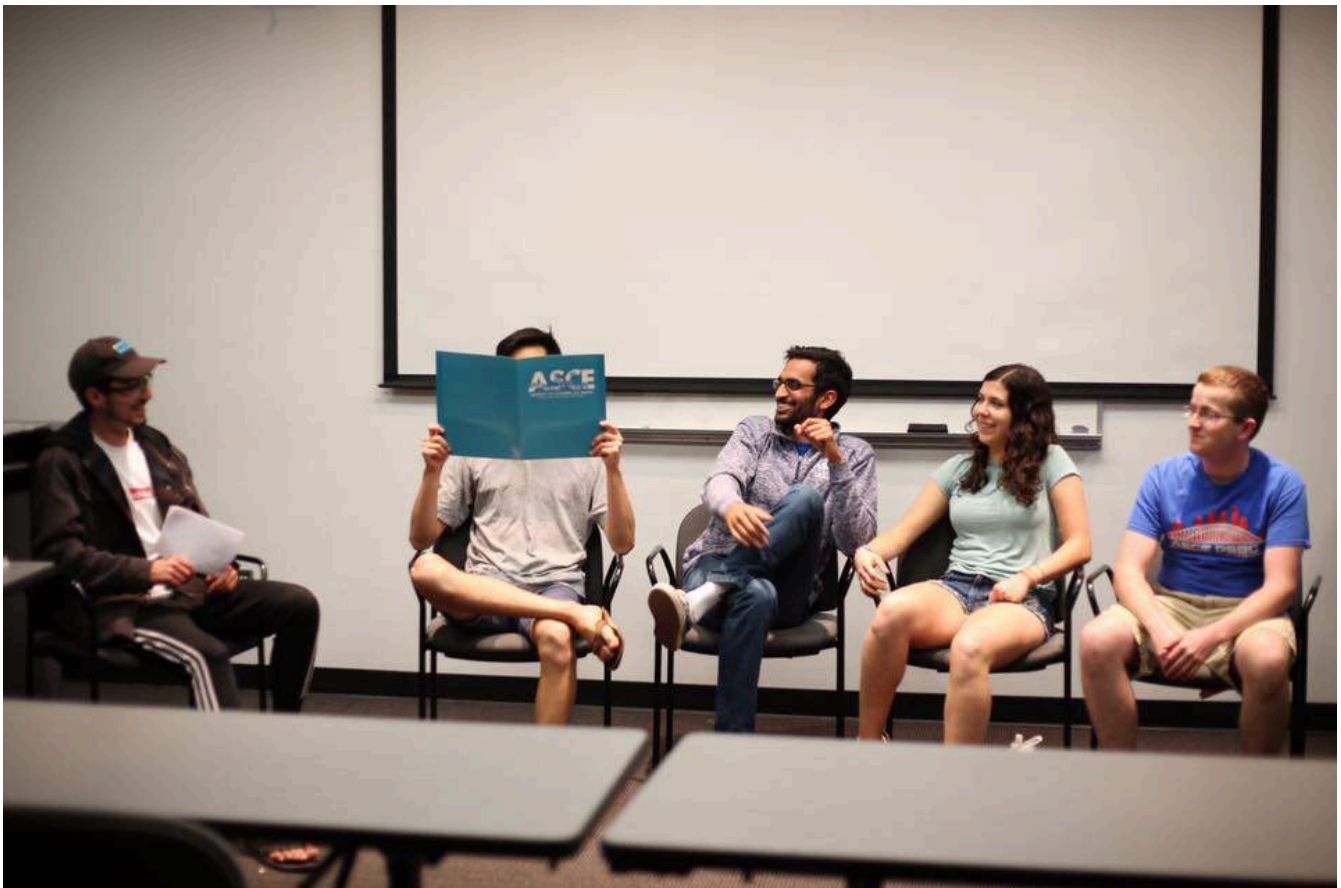
COOKIES WITH CORE Our CORE officers have a fun time while answering some great questions regarding the present and future of ASCE at UCLA.