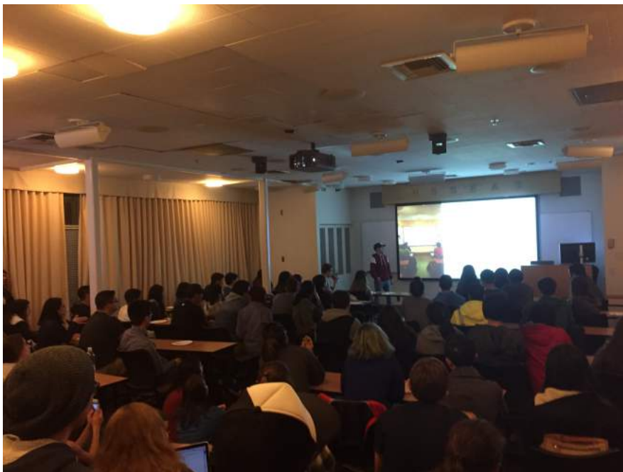
WINTER GENERAL MEETING General meeting at the start of the quarter to recap the fall quarter and inform the members about upcoming events.

We’ve continued our efforts to publicize our club with the purchase of 100 custom folders, given out as prizes or incentives to attend events, all with our logo on the front. Efforts have also ramped up to sell our large surplus of old project and member t-shirts from as far back as 2010, with them being sold at the general meeting as well as online. In fact, anyone can visit our Facebook page, “ASCE at UCLA” and check out the “T-Shirts for Sale” album to check out the selection of shirts. With so many members, we should be able to get through them all in no time. It’s looking to be a great year for our members, and we plan to go full steam ahead to give everyone the best possible experience as a member of our organization.