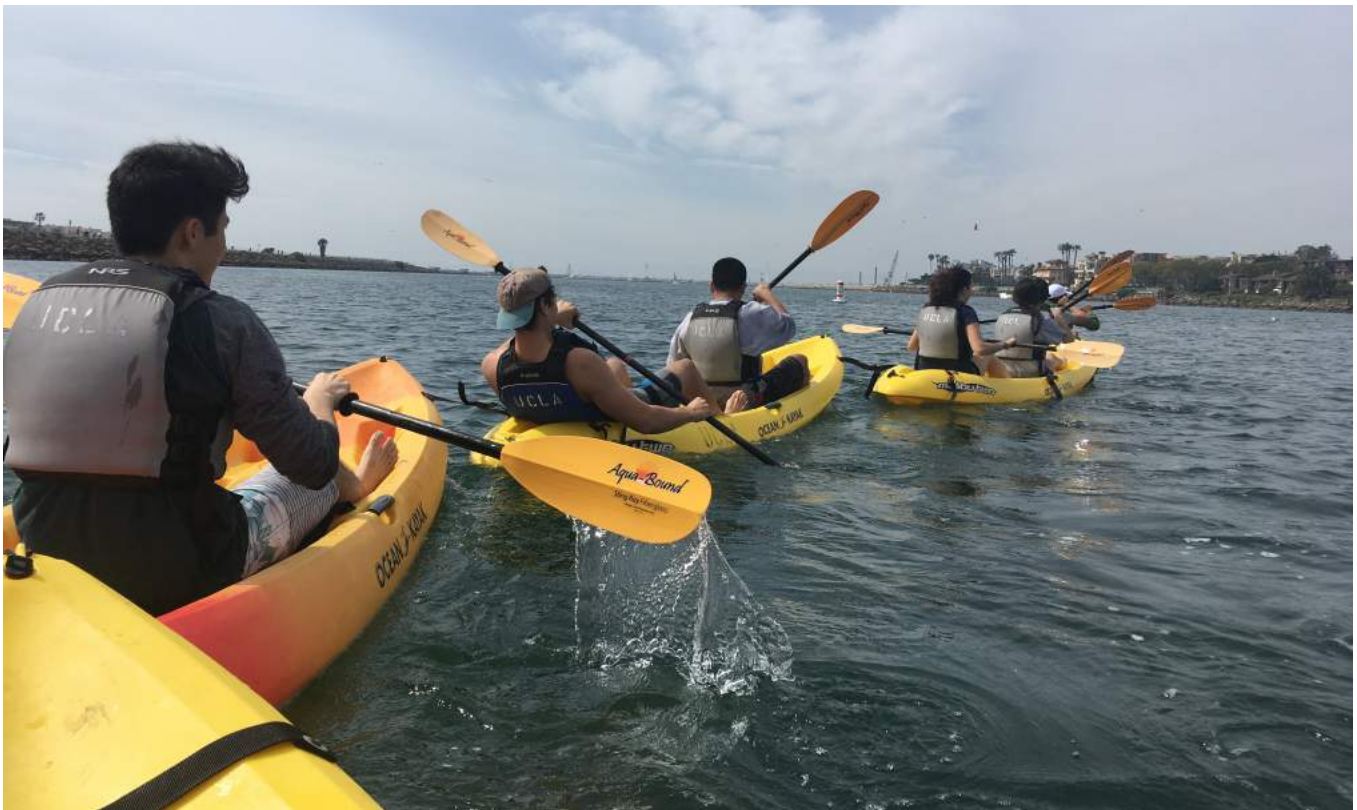
WINTER KAYAKING 10 members go to UCLA Marina Aquatic Center for kayaking.