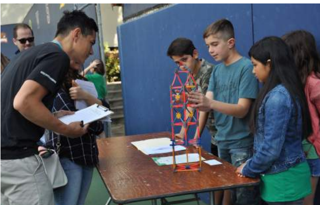
SEISMIC OUTREACH FINALE DAY A volunteer from one of the partnering companies, judges the student's structures .

This quarter Seismic Outreach serviced Hale Charter Academy. We worked with 250 sixth grade students and hosted our Finale Competition Day at UCLA again this winter. We were able to successfully partner with multiple industry volunteers from Degenkolb, John A. Martin and Associates, Pankow, W.E. Oneil and Arup who came and judged our student's structures. Additionally, we had staff and faculty from our own Henry Samueli School of Engineering to come and volunteer as well. We are very thankful for the help and support of our volunteers! Next quarter we are looking forward to working with Lincoln Middle School and service 355 students. We hope to only continue to see our program grow!