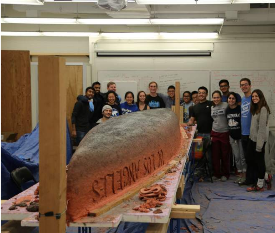
CASTING DAY 2K17 Members pose for a picture after the 9-hour workday where they completed the casting of the canoe.

Throughout the rest of winter quarter, we have been working hard to finish the canoe and prepare for the 2017 Pacific Southwest Regional Conference. Our paddling teams were finalized and the paddlers have been practicing all quarter long. We wrote and submitted our design report, and we've been constructing other project items that will be judged at competition, such as the cutaway, display, and stands. The cutaway displays a 4-foot section of our canoe, demonstrating the techniques and methods used to cast the actual canoe. Our stands mimic the magical mushrooms of Wonderland on which the canoe will rest. The main display is set up like a tea party that showcases our materials and academic papers.