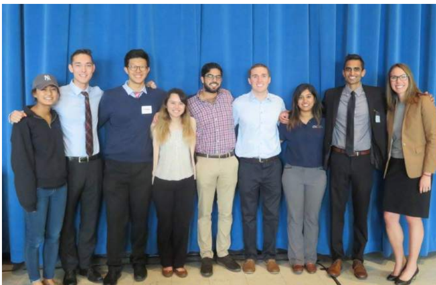
WINTER CAREER FAIR Student attendees and company representatives take a break and pose for a picture.