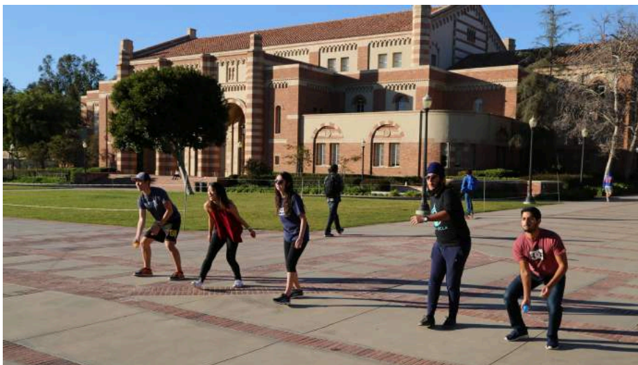
PSWC PUMP UP DAY Members have some fun time while playing with water balloons.

We are so excited to go and can't wait to keep you updated on how we do.