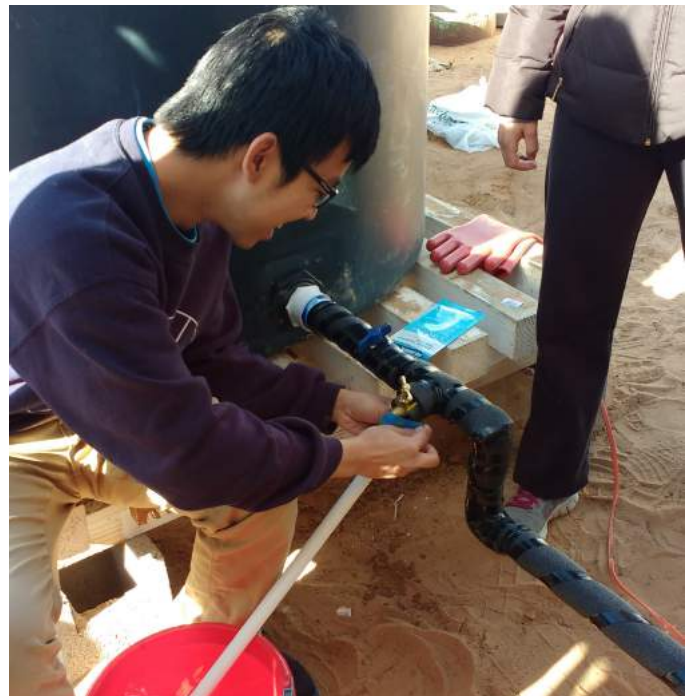
SPRING BREAK TRIP TO NAVAJO NATION One of the six members, who visited Navajo Nation, working on insulation.

Next quarter, the team plans to continue designing Phase Two of the pressurized water system which will include hot water and the installation of an additional sink and shower. Plans have already been made to work with the family to raise more money for the restroom addition by selling woven rugs made by master weavers. If you are interested in donating, joining, or mentoring our group, please feel free to contact us by searching for our project leaders' contact information on either the ASCE at UCLA or UCLA-EWB website.